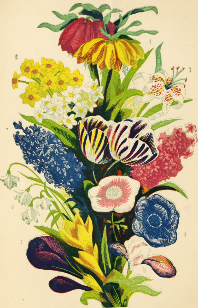
1. Crown Imperials. 2. Polyanthos Narcissus. 3. Japan Lily. 4. 5. Hyacinth. 6. Snowdrops. 7. Crocus. 8. Iris Germanica. 9. Anemone. 10. Tulips.